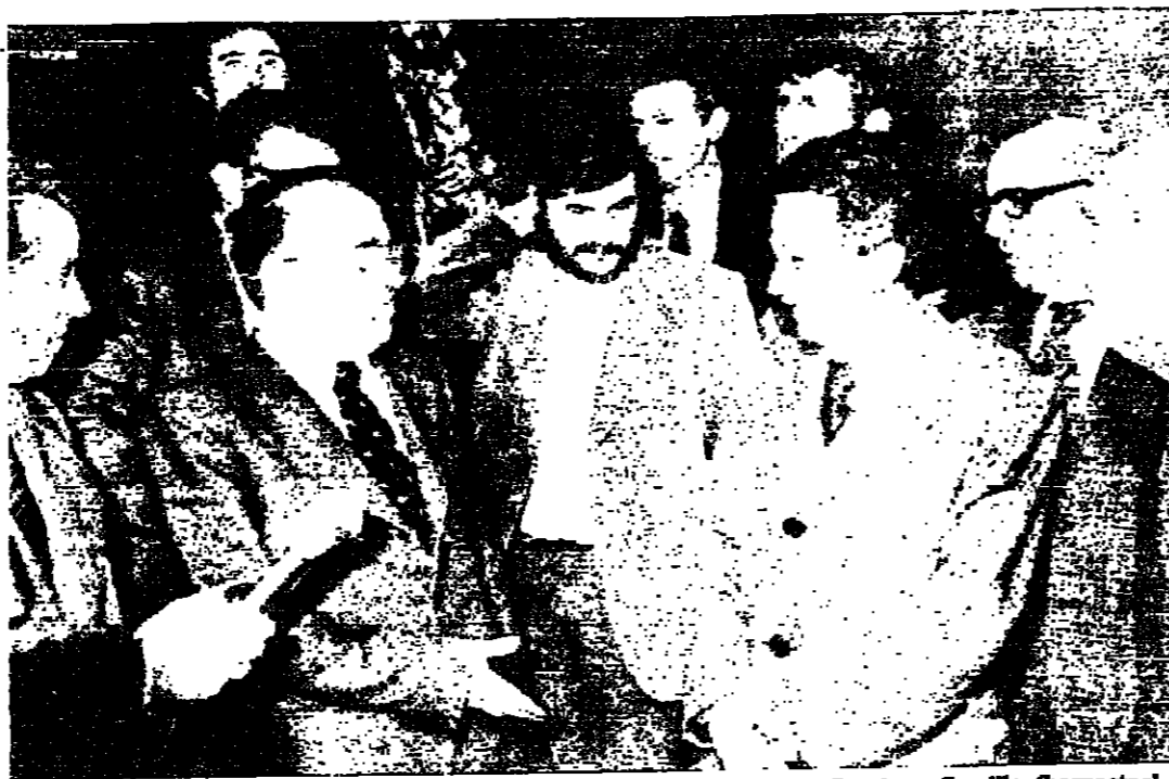
EURO-COMMUNIST SUMMIT -- Leader of Spain's Communist Party Santiago Carrillo (spectator, left) welcomes his Italian counterpart Enrico Berlinguer to the summit meeting of the leaders of Europe's three main Communist Parties in Madrid Wednesday. The third leader, not photographed, is the French party's chief Georges Marchais.

Israel is the largest recipient of military sales credits with billion dollars — nearly the overall total for the year. This is the same level as current fiscal year. Vance said the Carter administration was reviewing its foreign policy to ways to display and advance its human rights goals. He is convinced that this will help find expression in foreign policy, including foreign assistance, as legislation intended to be introduced for delivery to the House of Representatives Appropriations Committee's Subcommittee on Foreign Operations in apparent defence of a bill not to curb funds to Korea, which has been used for alleged human rights abuses, he said. Concerning human rights must be considered together with other economic and security goals. Decisions should be made country-by-country basis, he said. "We will ... strive for concy and evenhandedness. We do not have in mind sets of criteria for big tries, for weak countries, or communist countries," he said. "A proposed military assistance for the 1978 financial year beginning this Oct. 1, is $975 million, $3 million below the appropriation request by the outgoing Ford administration. The estimated disbursement